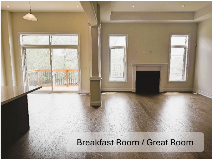
Breakfast Room / Great Room